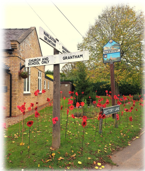
Poppies at the Reading Room