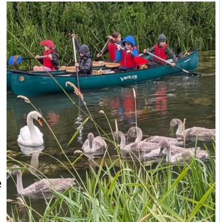
The Cubs canoed on Grantham Canal, watched carefully by a family of swans

The cubs expanded on their team work skills by working together to paddle along the canal and keeping up moral when the weather turned.