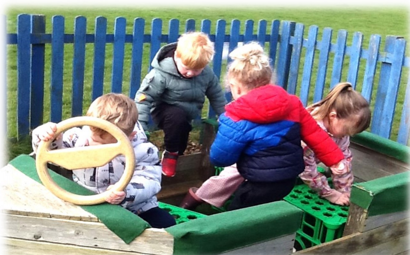
ALL ABOARD! Barrowby Preschool children having fun at play.

The next talk, on April 29th, will focus on the plight of hedgehogs, which are in serious decline in our gardens and the wider countryside.