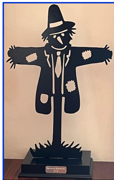
THE WINNER'S TROPHY

Please collect your prize from 39 Low Road Barrowby