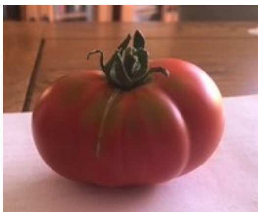
First tomato of the season!

https://www.barrowbygardenersassociation.co.uk