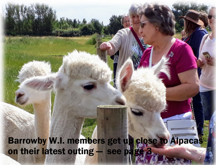
Barrowby W.I. members get up close to Alpacas on their latest outing — see page 3

We need volunteers to help deliver and collect questionnaires to all Barrowby households over weekends in September – please come to our stand or contact Nigel Jones on 07801 905690 to find out more.