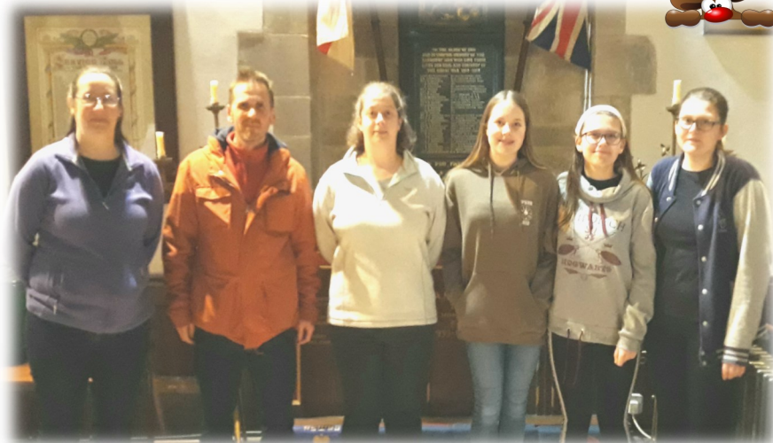
A First for teenage Barrowby Bell Ringers - see page 4

MEDICAL EMERGENCY? REMEMBER BARROWBY V.E.T.S.