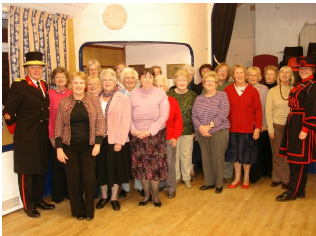
WI members at the Beefeater - the lady at the end is the only female beefeater.

We currently have 25 members and we meet together once a month at the Memorial Hall, where we enjoy a social evening, comprising discussions, competitions, raffle, usually with a guest speaker and, of course, tea.