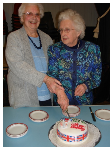
Two founder members cutting the 47th birthday cake.

This year we have been very busy; in May we celebrated our 47th Birthday with a special celebration cake which was cut by two of our founder members who are still very active with us. For our annual outing in July we joined forces with Harlaxton W.I. and had a great day out at Audley